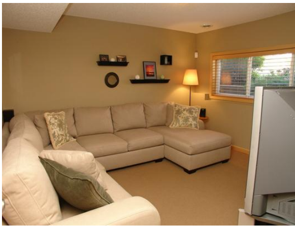
This will be the Longarm Room

With just the longarm – the plan is that when we have guests the longarm will be pushed to the wall and we'll find some type of cot(s) that can be stored when not in use.